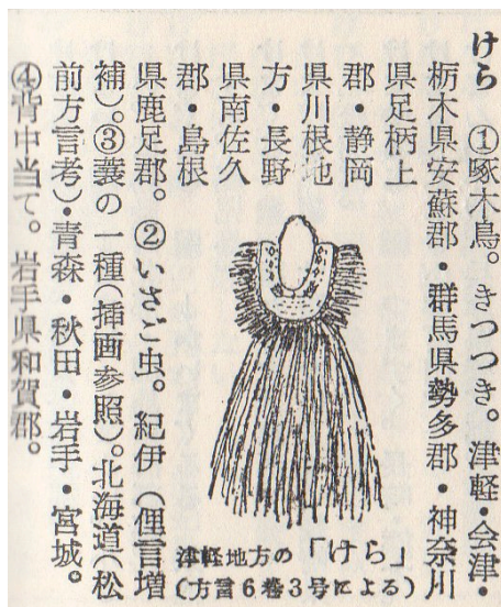
Figure 1. The image of kera 3): a kind of straw raincoat.