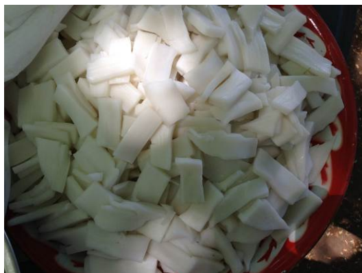
Figure 6. Starch pieces after steaming.