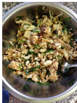
Figure 7. Fried starch pieces with other ingredients.

(Pictures taken by Siripen Ungsitipoonporn, 1 st June 2013.)