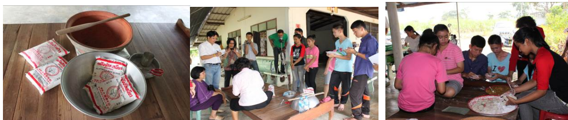
Figures 3-5. The process of cooking Hakka food: prepared ingredients; the instructor demonstrates; and the learners participate in cooking (pictures taken by Siripen Ungsitipoonporn, 14 th October 2012).

timeline activities that had already been planned. Example activities were cooking Hakka food and explaining what distinguishes it from other local foods. The learners practised cooking as much as possible, and video recordings of cooking were made. Recipes of Hakka food were compiled. This process involved learning by doing. The Hakka women, who were instructors, prepared ingredients for each Hakka dish. The learners practised cooking after the instructor demonstrated how to cook. Then, they ate the food together. After that they talked about the history of Hakka food, related to their experience and beliefs. The learners then wrote summaries.