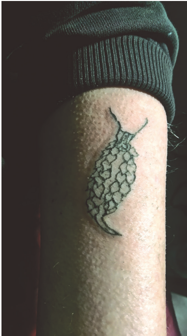
First chlorophyll tattoo. Transplant: Performance #1 “Devenir chienne pour devenir plant”. Transpalette Art Center, Bourges, France. November 2016.

our era constitute fertile terrain to build new alliances.