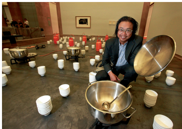
Rirkrit Tiravanija, Just Smile and Don't Talk , Kunsthalle Bielefeld, 11 July–10 October 2010 in Kunsthalle Bielefeld. The artist poses in the exhibition space with pots and 800 bowls ready for the opening when he himself will be cooking.

ritual roots, a communal dimension, and interacts with a cosmos thought of as a dynamic of forces that need to be kept in balance (see image below); traditions that would normally be held apart. The following discussion hence explores what kind of dialogue might be had between these visual practices that might be representative of the radical epistemological reframing of inter-knowledge that the post-abyssal entails.