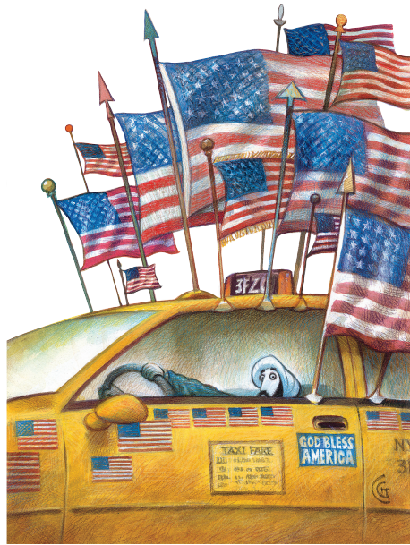
Carter Goodrich, Untitled , 2001. Watercolour and coloured pencil. Cartoon used for cover of November 5, 2001 issue of The New Yorker .

Given that the terrorist attacks of 9/11 were ascribed to Middle Eastern and Islamic, or Muslim, radicals, American legal scholar Leti Volpp surmises that those who appear “Middle Eastern, or Muslim-looking” – she mentions Latinos and African-Americans, for instance – practically became a new identity category in terms of United States citizenship (VOLPP, 2002: 1575). Although the American flag became increasingly visible as a marker of patriotism after 9/11, the cartoon indicates that for some subjects, displaying the flag became a necessity to prevent any potential misidentification as not only a terrorist, but as “not” American. 9 Indeed, this is at least part of the reason my own parents put various flags – that are still up – in their dry cleaning business, especially after receiving at least one threatening phone call that I know of to “go back home” after 9/11.