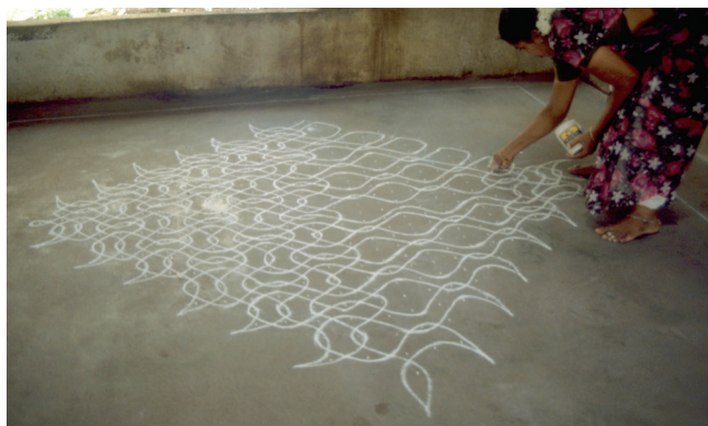
Kolams for special occasions are larger than the ordinary everyday threshold designs. This image shows a large traditional loop design normally executed for festive occasions drawn for a kolam competition.

And even though there have been local revivals, and kolam competitions are now regularly held, for example in Chennai, in the larger scheme of global visual practice this street art has remained invisible. As I have argued elsewhere, this reflects colonial legacies and accusations of primitivity that were levelled against Indian culture during the colonial period and led to a distancing from practices that could not easily be appropriated as high art in the post-colonial era (DOHMEN, 2001). The neglect of the practice therefore demonstrates the difficulty of reconciling Western notions of art and originality with practices rooted in ritual traditions, that is, a world view that does not endorse the scientific perspective characteristic of abyssality: the designs rather are rooted in a world where matter is seen to be in continuous flux and needs to be kept in balance, with kolam participating in the daily balancing activities required for a happy life and community. The street designs, therefore, constitute but the everyday street version of the indoor expression of a female ritual practice called nonpu , where they are used in ritual to establish a pure space for the invoked deity to descend into.