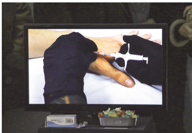
RFID chip attachment. Video projection – Installation “TransPlant #1”. Transpalette Art Center, Bourges, France. November 2016.

mata acuminata cells through photodynamic therapy and, finally, the creation of public open-source data of the experiments. 12