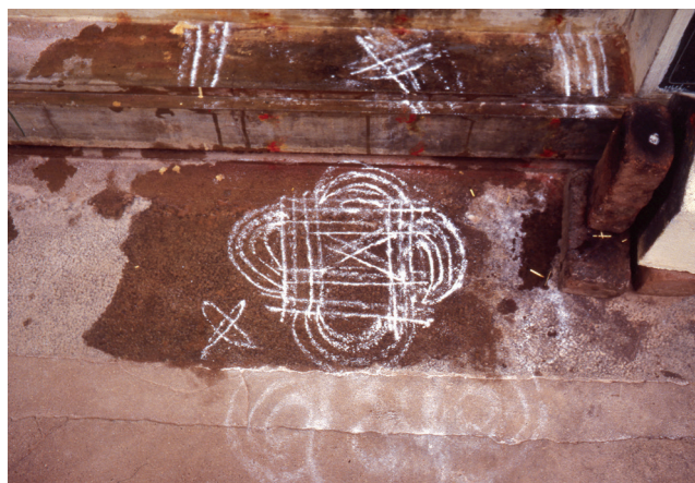
A new design has just been drawn to replace the kolam drawn at sunrise. The morning's design is only partially erased and the ground is still wet from washing the ground prior to drawing the new design.