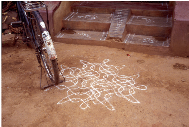
Tamil threshold designs are not considered precious and everyday activities are carried out without concern for preserving the designs. In fact they are drawn to be erased by the community's everyday activities. The photo shows a bicycle parked on a traditional Tamil loop design drawn around a grid of dots in front of a residential dwelling.

The drawing of threshold designs is an ancient, pan-Indian practice with disparate regional design styles. It constitutes a daily, domestic, female routine in which the whole community participates: the women draw the designs twice-daily and the community witnesses their presence, but also erases the drawings as part of the ebb and flow of everyday activities (see image below). The designs' creation and deletion are everyday motions that are perfunctorily performed. The Tamil version of the practice is referred to as kolam , and will form the basis for this discussion. Tamil designs traditionally are abstract compositions created by looping continuous lines around a structure of grids that determine the design (see p. 87). The women think of the practice as housework rather than art. It has communal and ritual dimensions, and is located on the "other", invisible side of Santos's abyssal line as a cultural practice: even though the designs are in public view on the streets of the Tamil Nadu, they have, as the cultural anthropologist Stephen Huyler noted, along with other female decorative arts of India, "received almost no recognition" (HUYLER, 1994: 10)