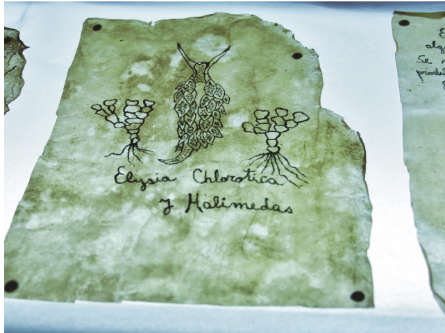
Skin book. Chlorophyll tattoo on microbial cellulose.

travellers must pass to get much of anywhere in the world. The chip, gene, bomb, fetus, seed, brain, ecosystem, and database are the wormholes that dump contemporary travellers out into contemporary worlds” (HARAWAY, 1997: 43). TransPlant engages in current debates about the Anthropocene from a perspective that is not based on human exceptionalism and methodological individualism, but that addresses the world and its inhabitants as the product of cyborg processes, sympoiesis or becoming-with in “multispecies muddles” (HARAWAY, 2016: 32).