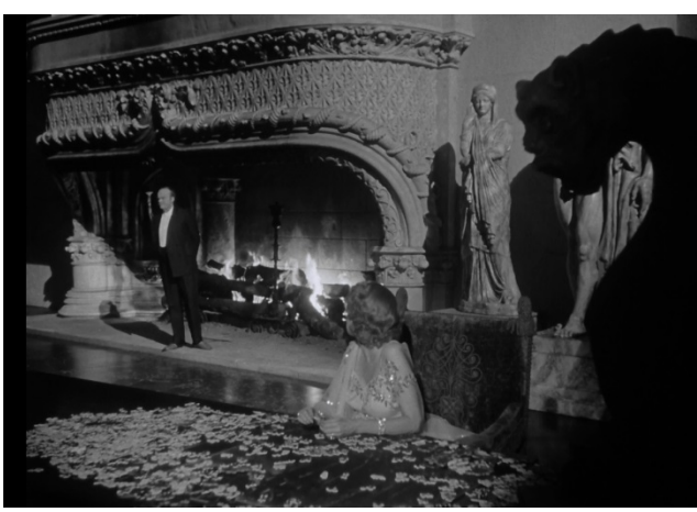
Stage in Holiday (1938)