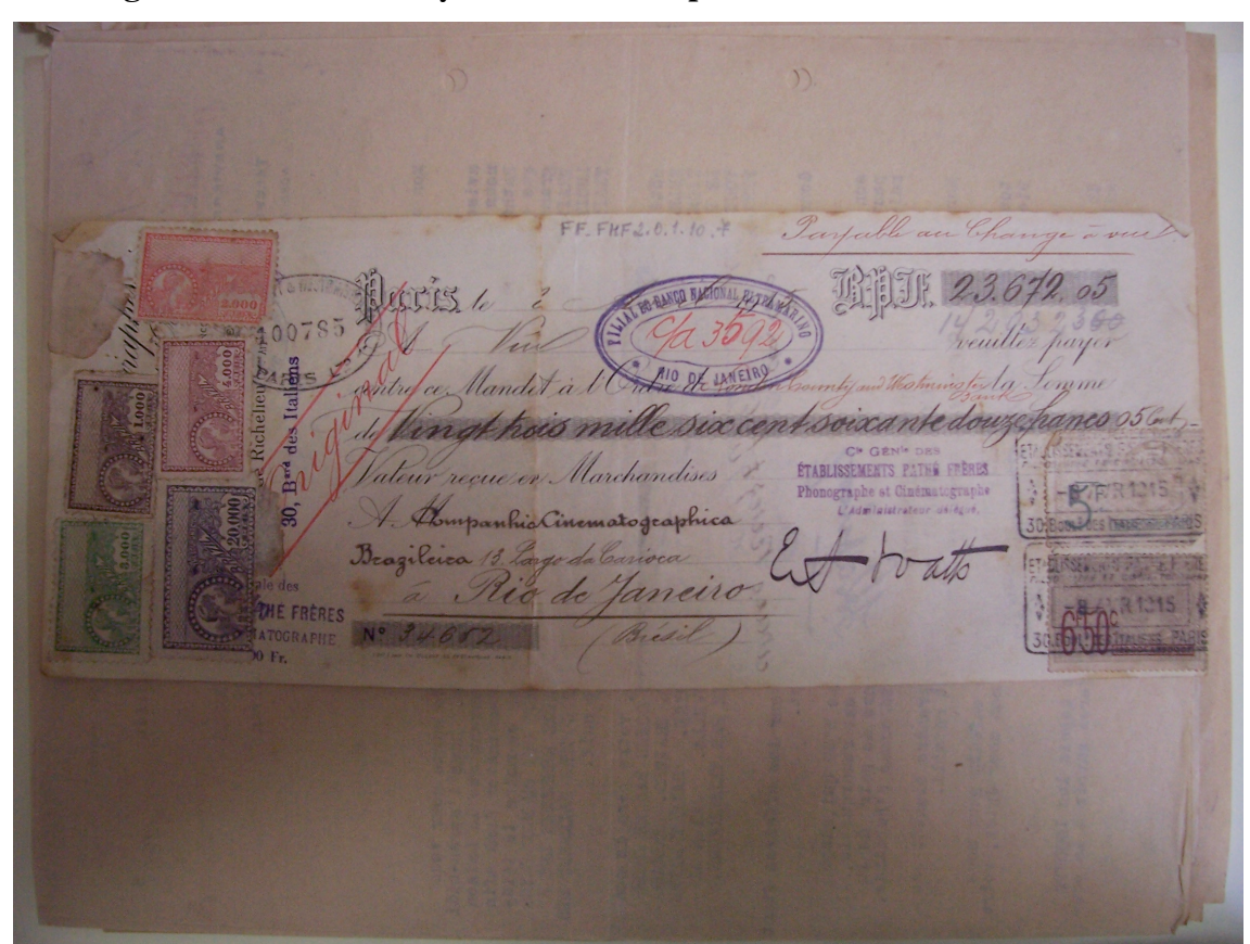
Image 6: International Payments and recieps from the CCB and Pathé Frères